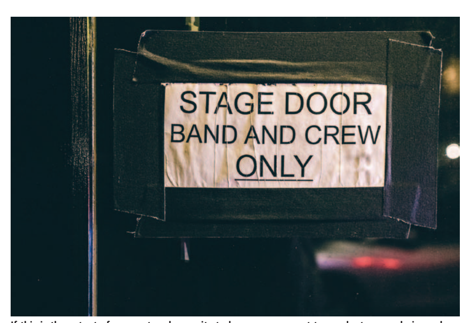
If this is the extent of your network security today, you may want to revaluate your choices when building production infrastructure.

While inside a building, VLANs prevent interdepartmental crosstalk, but, you're not to expect a malicious attack coming from a fellow crew member working on the same gig as you. As directors and producers worry about the actors on the stage, manufacturers must work to ensure to mitigate any threat of bad actors entering the theatre uninvited. Some productions deal with security by building a big wall around their insecure legacy systems, but in this day of IoT connectivity, it is becoming more and more difficult to remain an island. A single laptop at the production table connected to the entertainment network can join a Wi-Fi