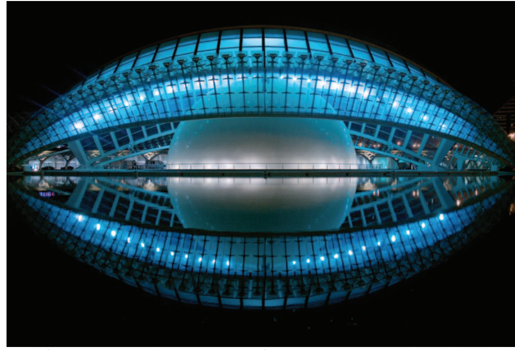
High profile architectural installations are prime targets for network hackers.

All this connectivity comes at a price. There is an initial cost to install and configure these systems, but the real cost